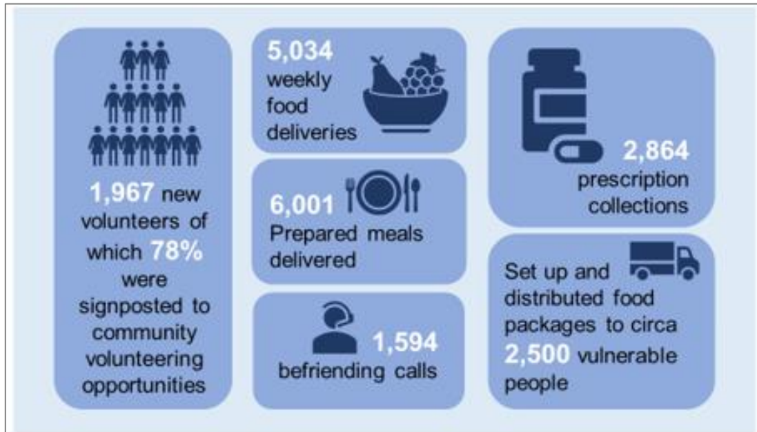
Figure 2: Supportive Communities Response to Covid 19

15. In addition, the Supportive Communities Programme also delivered: