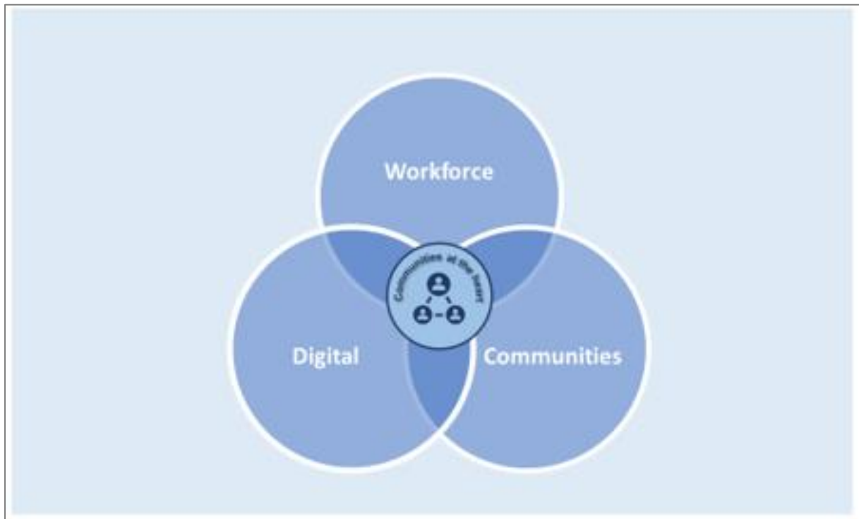
Figure 1: Supportive Communities Programme

13. The objectives for the programme for 2020 were as follows: