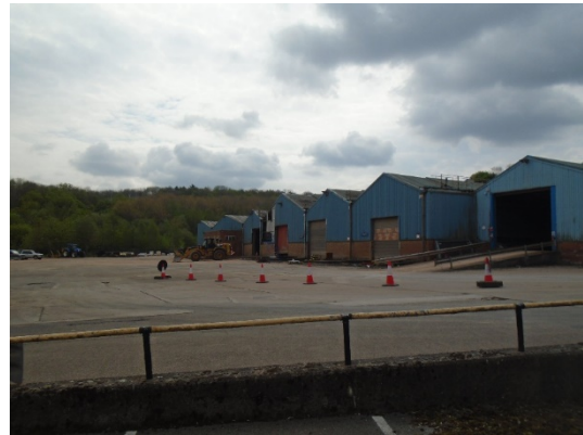
Offices and hardstanding (left) and Warehouses /storage buildings (right)