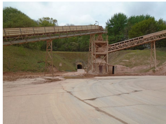
Weighbridge with conveyor in the background (left) and conveyor (right)